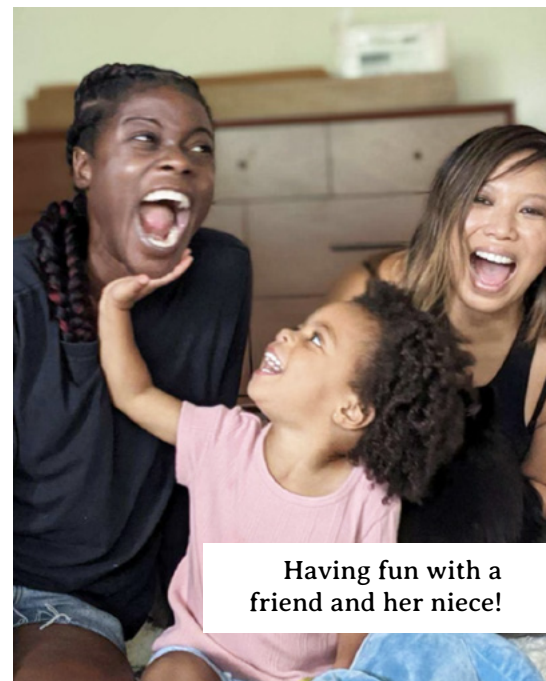
Having fun with a friend and her niece!