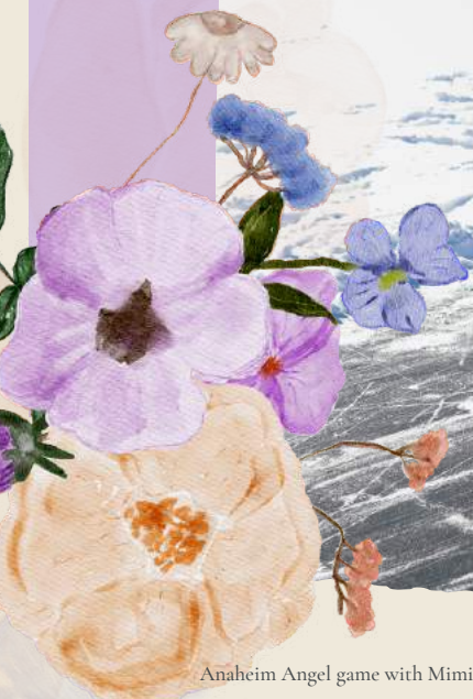
Anaheim Angel game with Mimi