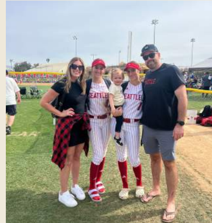
Cheering on the Aunties in their college softball tournament in La Quinta, CA