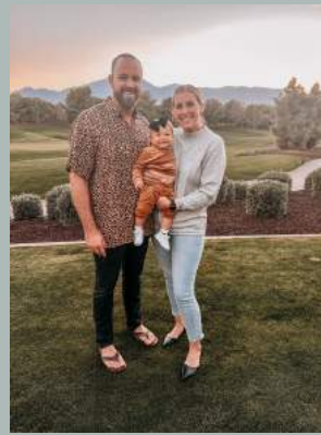
Thanksgiving in Palm Springs!

We enjoy lots of watermelon and festive foods and then get cozy and watch the fireworks on the beach!