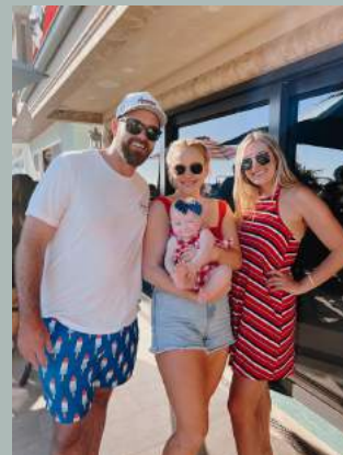
4th of July at Grandma and Papa's house