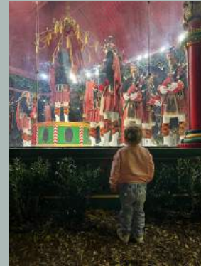
Looking at the 12 Days of Christmas installment at the Dallas Arboretum