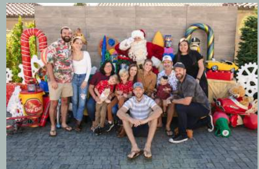
Santa Breakfast at our golf club in Palm Springs