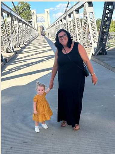
Exploring Waco, TX with Grandma!