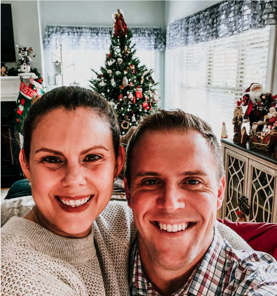
Photo to the Left - Christmas North Carolina in 2021.