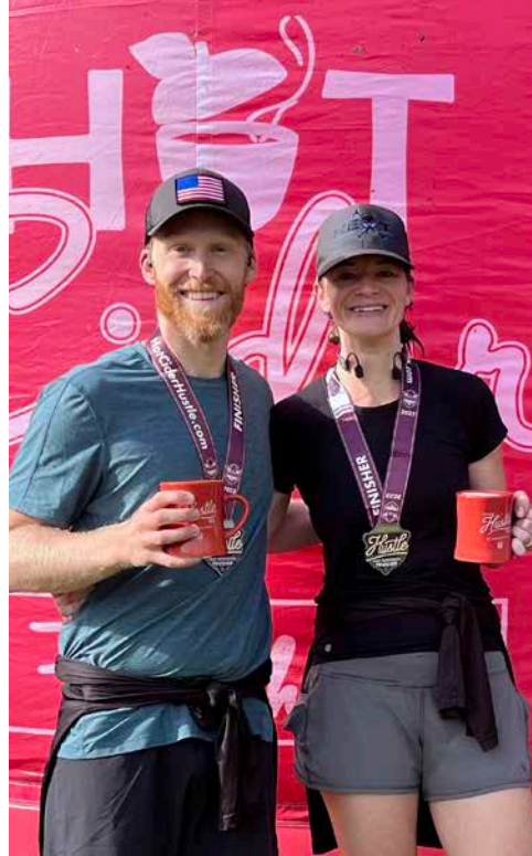
We survived our first half marathon