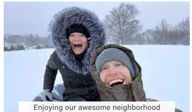
Enjoying our awesome neighborhood sledding hill

We are also big ice cream enthusiasts; whenever we travel we are always on the lookout for the local favorite.