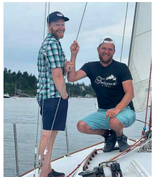
We love sailing with family every summer in Maine