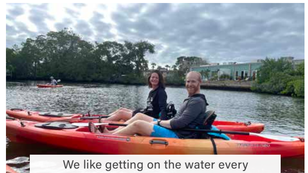
We like getting on the water every chance we get