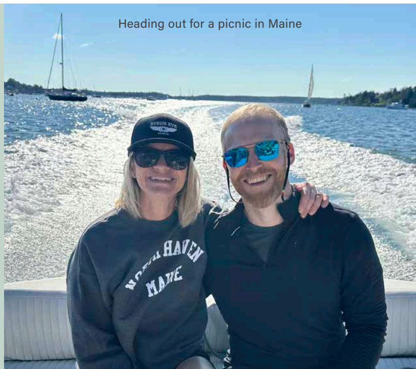
Heading out for a picnic in Maine