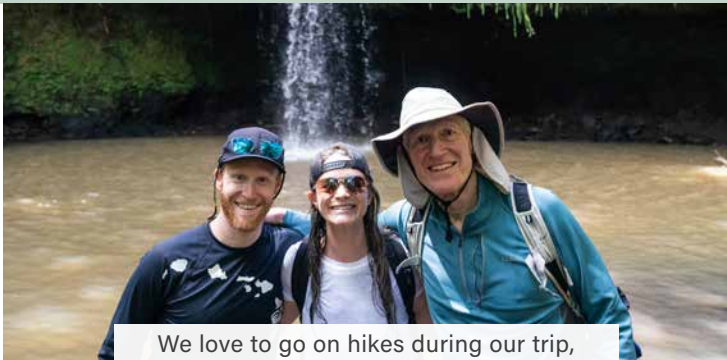
We love to go on hikes during our trip, Hawaii was a favorite