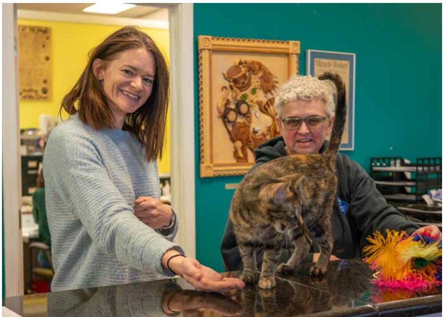
Volunteering at the animal rescue is so rewarding