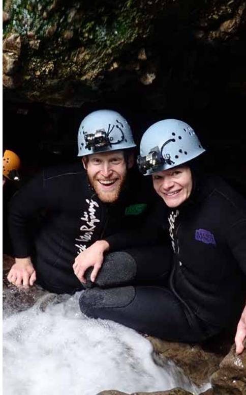
We love trying new things on vacation, like exploring caves!