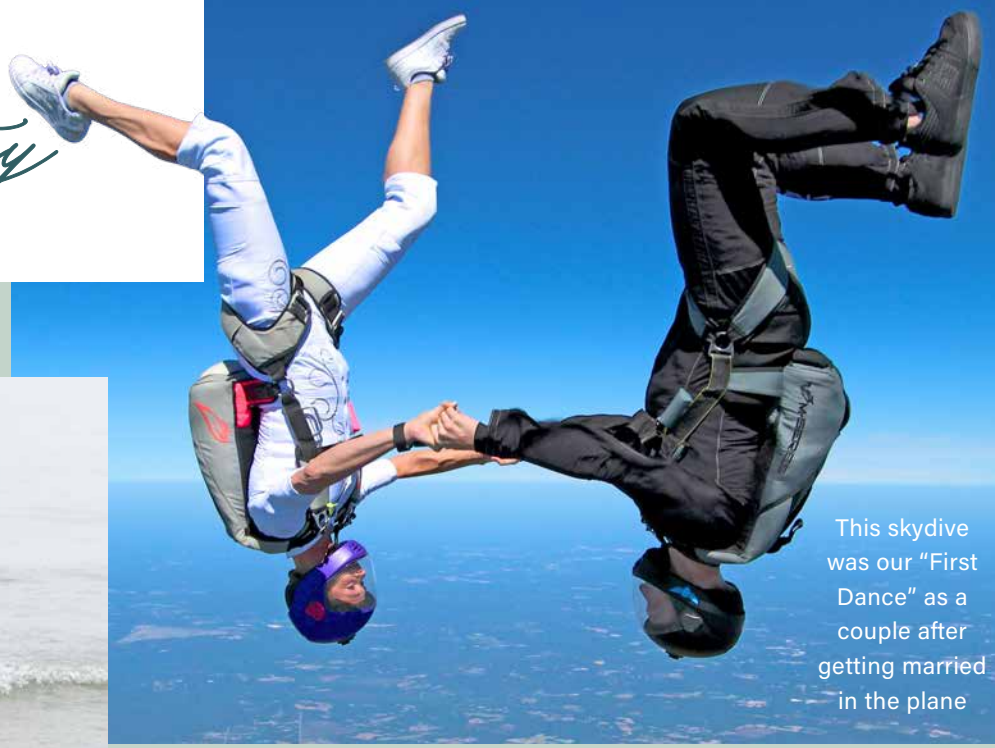
This skydive was our "First Dance" as a couple after getting married in the plane