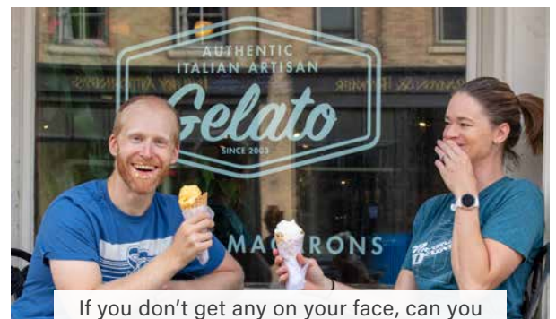
If you don't get any on your face, can you really call yourself an ice cream enthusiast