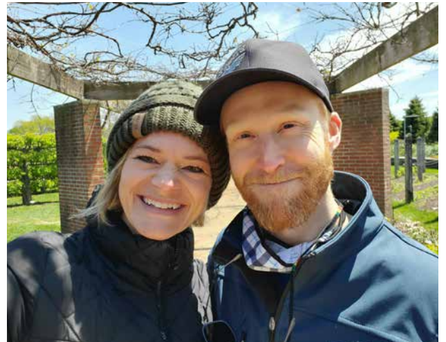
We celebrated our 9th anniversary at the Chicago Botanical Garden