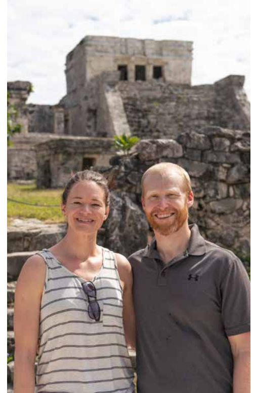
We enjoyed learning about Mayan culture while visiting Mexico