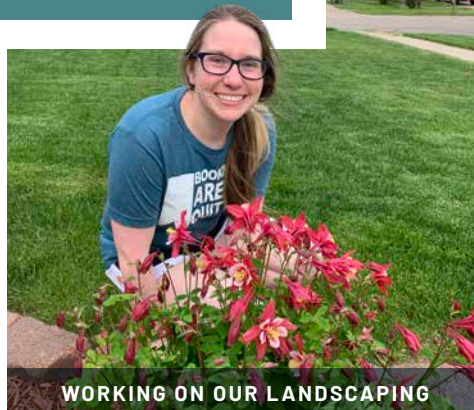
WORKING ON OUR LANDSCAPING