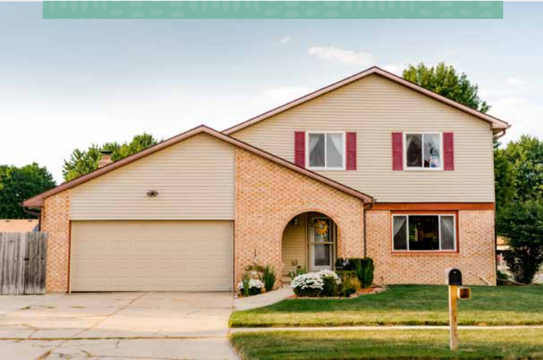
WE LOVE OUR COZY AND COMFY HOME

We have a beautiful trail system nearby, where we like to go and walk. There are also several playgrounds within walking distance that we enjoy taking our daughter to.