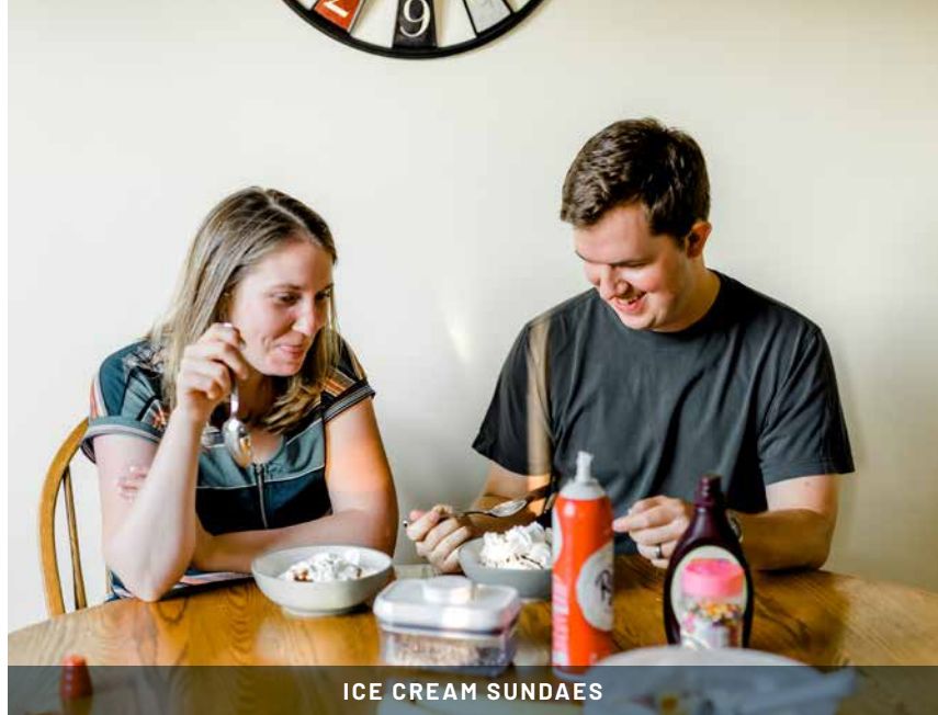
ICE CREAM SUNDAES

Our experiences with pregnancy loss and infertility, while devastating, brought us closer together.